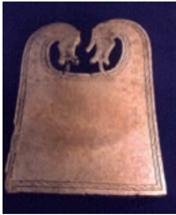
scar plaque - orkney museums and archive