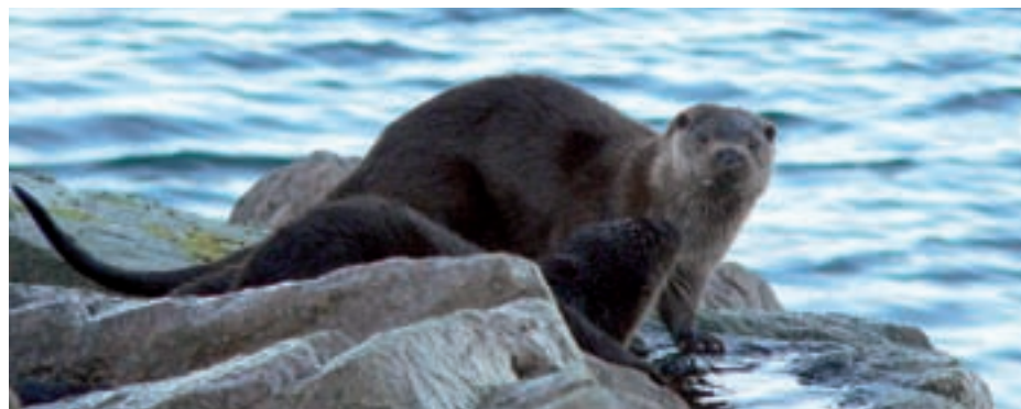
otters - roderick thorne

Sanday Arts Festival - Sept. See local notices.